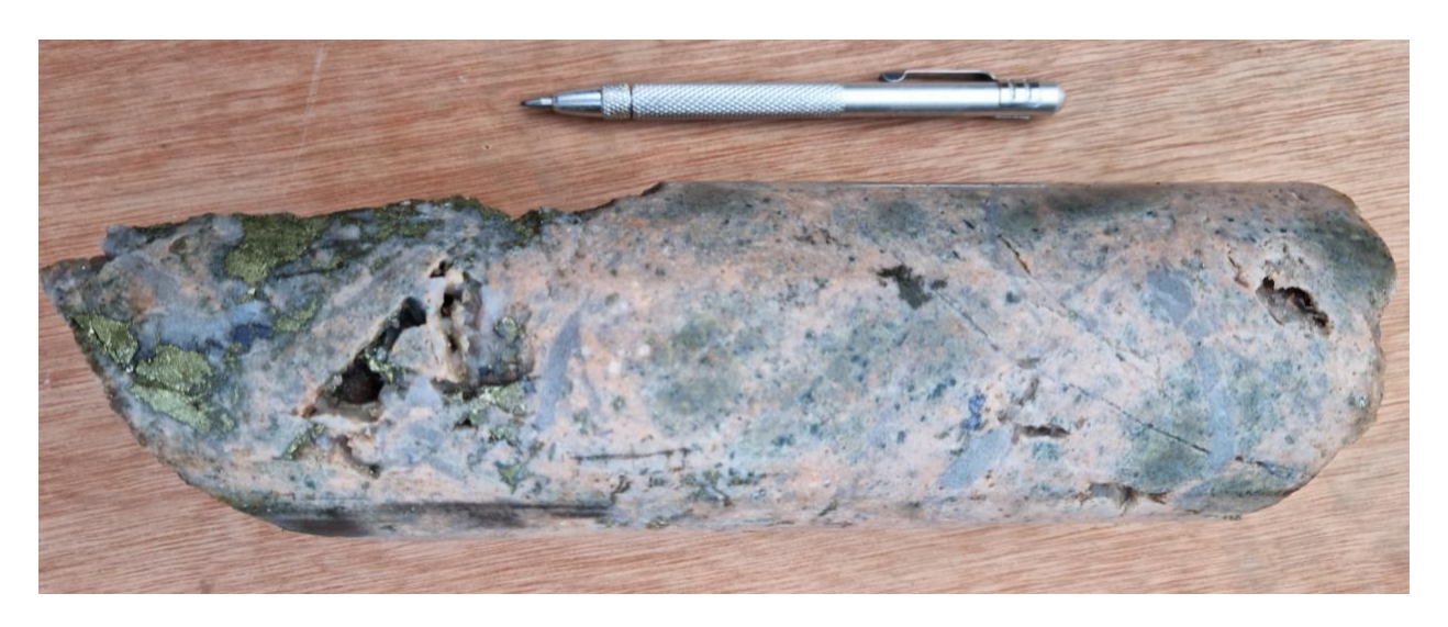
Photo 1: Assay interval returned 1.66% CuEq (1.31% Cu and 0.104% Mo) over 1.5m from 228.76m – 230.26m. Dacite porphyry breccia: strong potassic alteration (pink) overprinting earlier phyllic alteration, quartz with chalcopyrite, molybdenite veinlets, disseminated molybdenite (grey speck) and chalcopyrite.