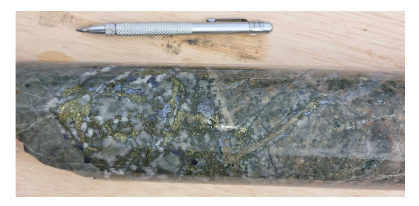
Photo 2: Assay interval returned 4.78% CuEq (2.31% Cu and 0.743% Mo) over 1.5m from 269.81m-270.31m. Silicified dacite porphyry breccia: phyllic alteration with local strong potassic overprint. Several generations of quartz veining and chalcopyrite - molybdenite, with disseminated molybdenite and chalcopyrite.