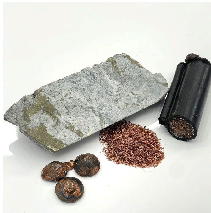
Photo 3: Drill core from the Mocoa porphyry copper-molybdenum project, copper produced together with the UNAL from the project (see news release December 6, 2022 ), and copper recycled in Colombia.

Libero Copper is working together with the Ministry of Industry & Commerce, Ministry of Energy & Mines, National University of Colombia ("UNAL"), local businesses, communities, and green technology start-ups to develop a copper-based production chain in Putumayo and Colombia starting with recycled copper but underpinned by the Mocoa porphyry copper-molybdenum deposit.