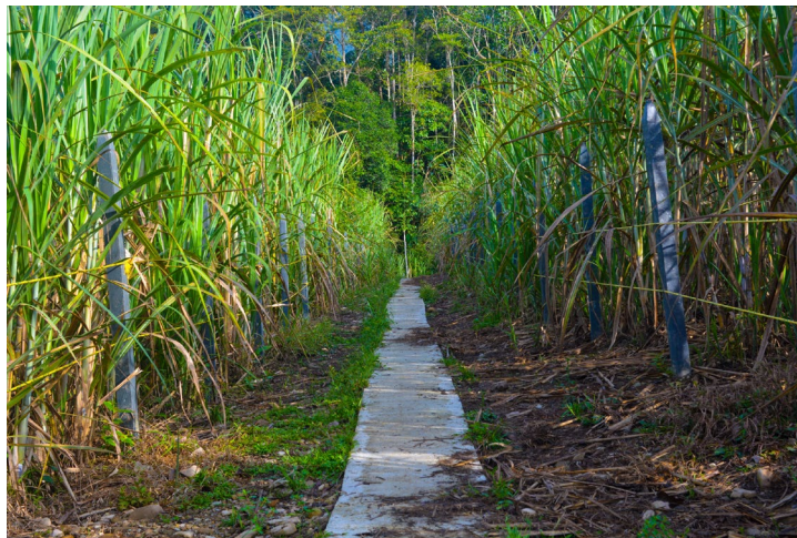
Photo 2: Section of the San Jose Access in Harmony with Local Development