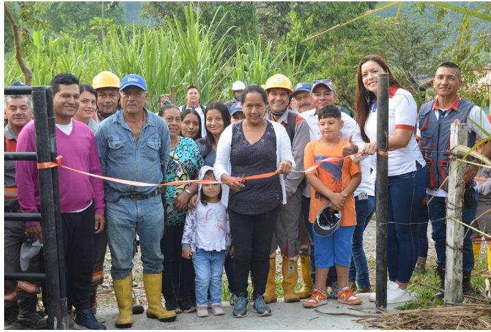
Photo 1: Ribbon Cutting Event with the Community of Montclar for the San Jose Access

February 2, 2023 – Libero Copper & Gold Corporation (TSXV:LBC, OTCQB:LBCMF, DE:29H) (“Libero Copper”) is pleased to announce the completion of the new San Jose access to the Mocoia porphyry copper-molybdenum project located in Putumayo, Colombia. The access is 2,100 metres in length for the transport of drills and supplies, which eliminates expensive helicopter support for drilling activities around the deposit area. In accordance with the cooperation agreement signed with Montclar (see news release November 29, 2022 ), the access was co-planned with the community. The process ensures the new San Jose access supports the advancement of the project and the long-term development plans of the community of Montclar including improved access to established economic activities, such as artisanal raw sugarcane production.