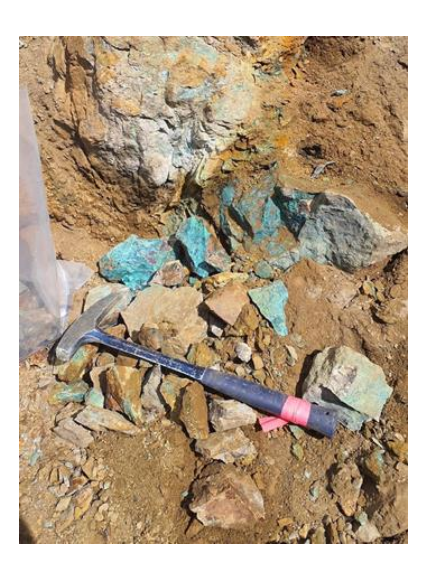
Figure 2 : Photograph of mineralization observed in the new Scorcher showing strong malachite and chrysocolla mineralization and disseminated chalcopyrite hosted in a syenite phase.

Samples from the new soil sampling grid were analyzed onsite with a portable X-ray fluorescence (pXRF) device for multiple elements (Figure 3). Quality assurance of the pXRF results was done by sending split soil samples to an accredited laboratory for confirmatory analysis. Similar to the soil grid over the Terry target, the new grid outlined a widespread and remarkably high Cu-in-soil anomaly, with numerous multi-sample anomalies in excess of 0.1% Cu, consistent with high-grade copper rock sampling identified in the new showings, e.g. Scorcher (Figure 2). The final drill hole of the season was oriented to test newly identified copper mineralization at the Scorcher discovery (a second porphyry target located 2 km southeast of Terry) and the associated overlying soil anomaly.